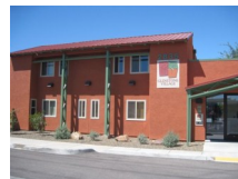
Glenstone Village, Tucson Developer: Compass Affordable Housing