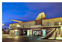
Glendale Enterprise Lofts, Glendale Developer: Arizona Bridge to Independent Living/Gorman & Company