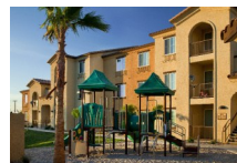
The Legacy Crossing, Phoenix Developer: UMOM New Day Centers/The NRP Group